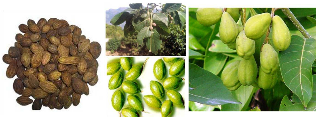
Figure 1 Terminalia chebula fruit, leaf and tree

Terminalia chebula is routinely used as traditional medicine in the name of 'Kadukkaai' by tribal of Tamil Nadu in India to cure several ailments such as fever, cough, diarrhea, gastroenteritis, skin diseases, candidiasis, urinary tract infection and wound infections 16 . Antibacterial activity of Terminalia chebula extracts against several bacterial strains have been reported 17 . Extracts from different parts of diverse species of plants like root, flower, leaves, seeds, etc. exhibit antibacterial properties were applied on cotton material for wound, healthcare care application 18 . It is a well known fact that the demand for the herbal drug treatment of various ailments is increasing and plant drugs from the ayurvedic system are being explored more, not only in India but also globally. As a result, many research studies are being undertaken and there is a need for an update and to put them together. In this article an attempt has taken to recapitulate available pharmacological studies for Terminalia chebula . The first part of the article explains the natural species identity, habitat, botanical description, chemical constituents. The second part abridges the various pharmacological studies so far done with the different extracts of Terminalia chebula fruits, leaf and bark extracts.